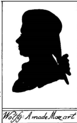
Wolfgang Amadeus Mozart